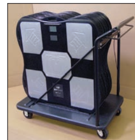
Pad Storage Cart